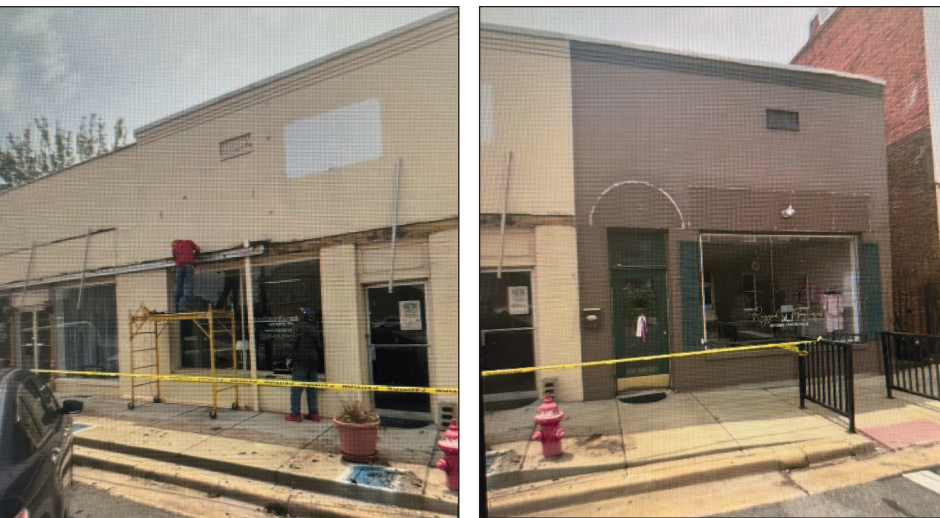
“Capturing the Heart of Our Community One Corner at a Time” From the overlooked to the cherished—every corner of our community carries a memory. Pause for a moment, and even the smallest details reveal their stories. Every building has a past—if these walls could speak, what tales would they tell? “Main Street is getting a fresh new look—out with the old, in with the new!”