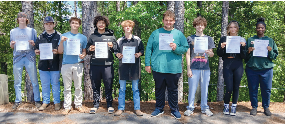
Seniors from select programs at Bibb County Career Academy earned over $15,500 in fees and tuition waivers to the Alabama community college of their choice. These students completed the Alabama Certified Employee Credential and earned a National Career Readiness Certificate by obtaining a qualifying score on their ACT WorkKeys Exam. More information on this initiative can be found at www.accs.edu/ace/ .